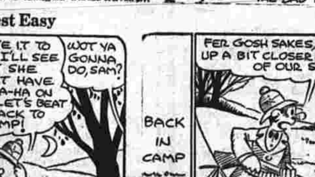
SALESMAN SAM Now Duzz Can Rest Easy By SMALL