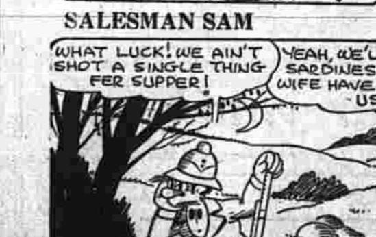
SALESMAN SAM Now Duzz Can Rest Easy By SMALL