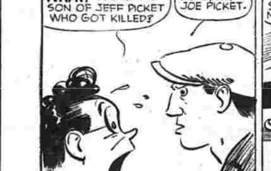
WASHINGTON T. By Crane