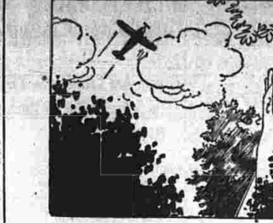
Toonerville Folks By Fontaine Fox