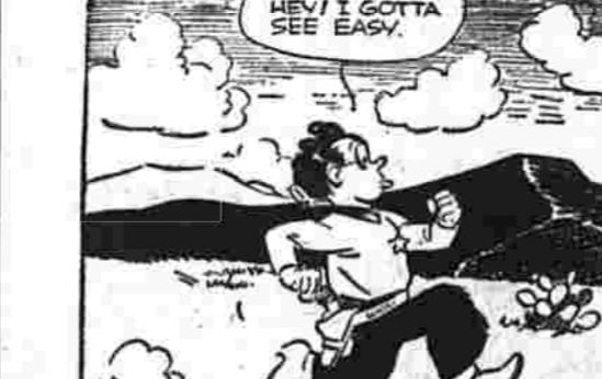
OUT OUR WAY