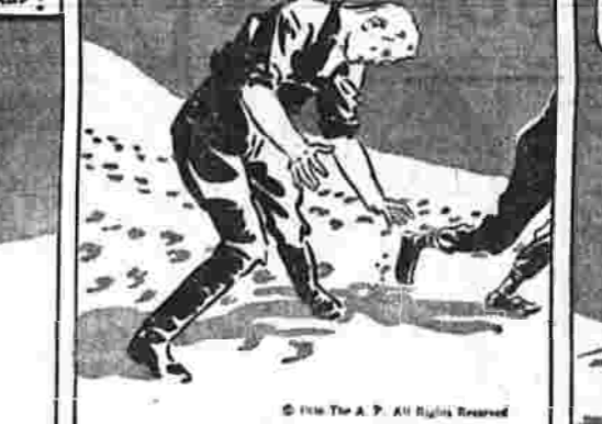
Desert Dog Dies