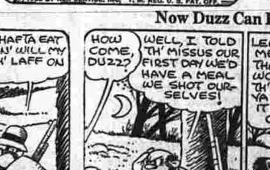
SALESMAN SAM Now Duzz Can Rest Easy By SMALL