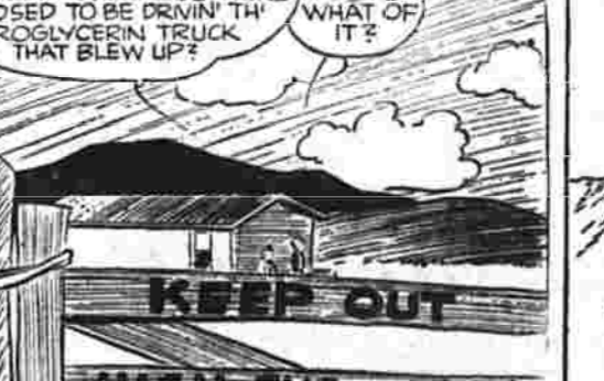
WASHINGTON T. By Crane