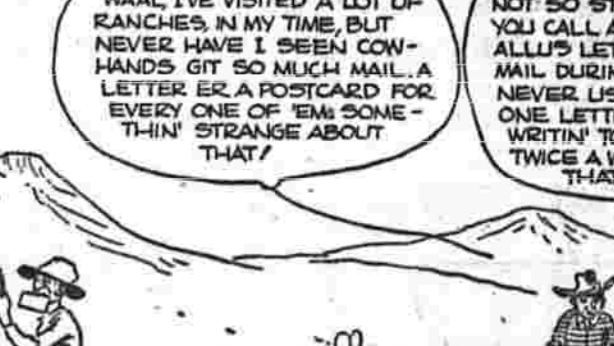
WASHINGTON T. By Crane