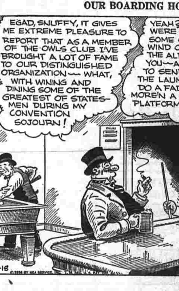
OUR BOARDING HOUSE