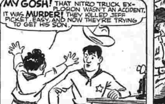
OUT OUR WAY